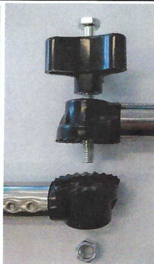
C), D) & E) Support Tube joint assembly.